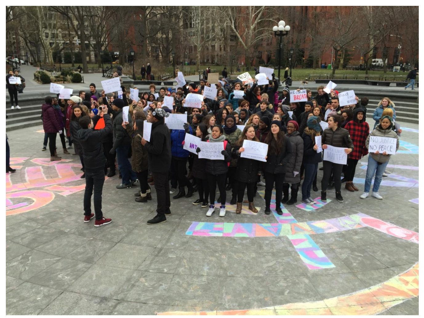
THE LITTLE RED SCHOOL HOUSE AND ELISABETH IRWIN HIGH SCHOOL STUDENTS CHANT IN WASHINGTON SQUARE PARK AS PART OF THEIR #BLACKLIVESMATTER WALKOUT IN DECEMBER 12, 2014.