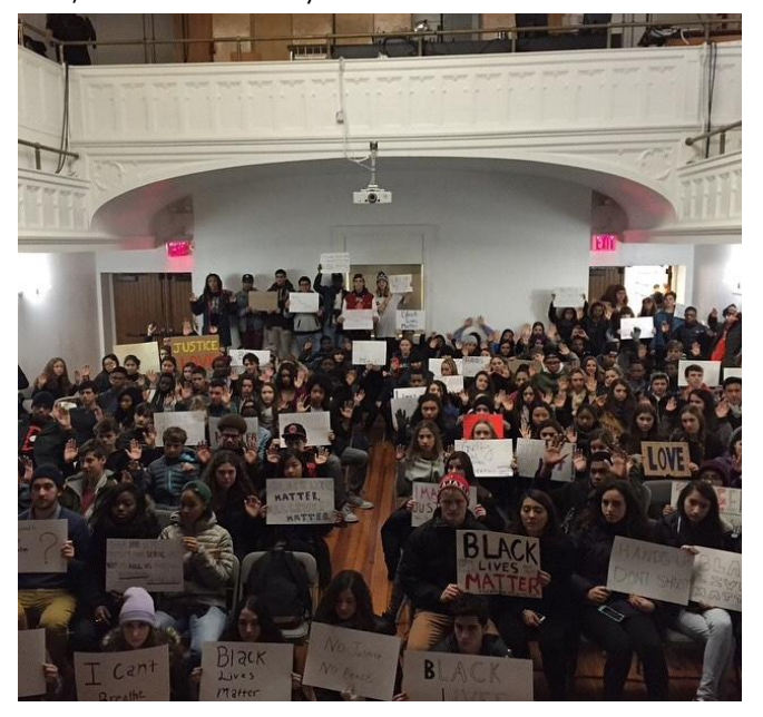
STUDENTS AT LREI GATHER BEFORE THEIR #BLACKLIVESMATTER WALKOUT ON DECEMBER 12, 2014.

they [white people] don't expect you to strive for excellence. This is not something that I heard often as a child. I would speak to my father about race a lot and I still do, but to hear it in a piece of literature, it's something that I've never heard writers write about before. It gives me more of a reason that Baldwin should be put into the curriculum in schools. It can help inspire kids to think in a different light. I would say that The Fire Next Time is making me think about race in a different light than what I was thinking about previously and my experience of going here as well. In the book, he talks about a time a police officer comes up to him and calls him the 'n' word and beat him, and that definitely resonated with me. Baldwin talks