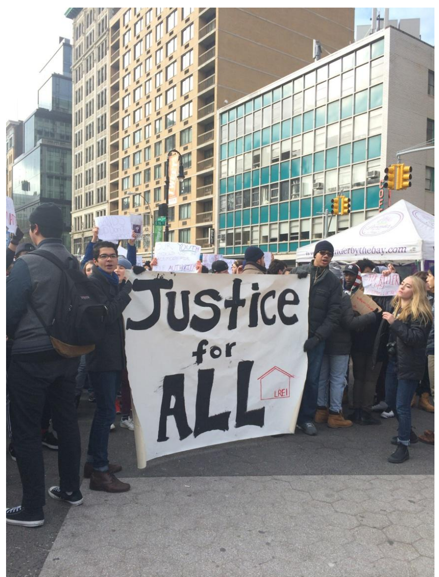
LREI STUDENTS CARRY A #BLACKLIVESMATTER SIGN INTO UNION SQUARE (IMAGE: ILEANA JIMÉNEZ).

Kalli: One nightI was thinking about how frustrating it is to be talking about how angry we are that Black lives don't