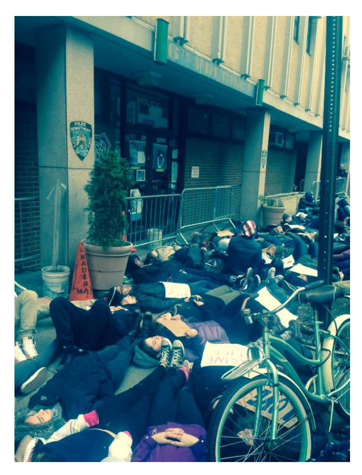
LREI STUDENTS CONDUCT A DIE-IN IN FRONT OF A NEW YORK CITY POLICE PRECINT IN THE WEST VILLAGE, DECEMBER 12, 2014.

of the work by interviewing our peers and family members. This is something that is very close to us. It's not something that we are out of touch with.